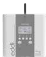
myenergi Eddi energy diverter C2160