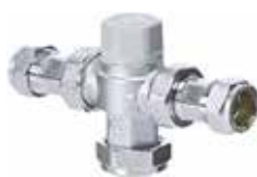
Tempering valve C5388